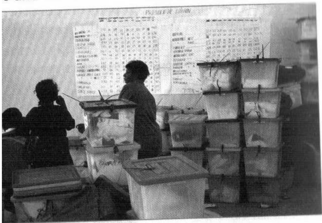
Counting the results at the polling station

Study the picture below and answer the questions that follow.